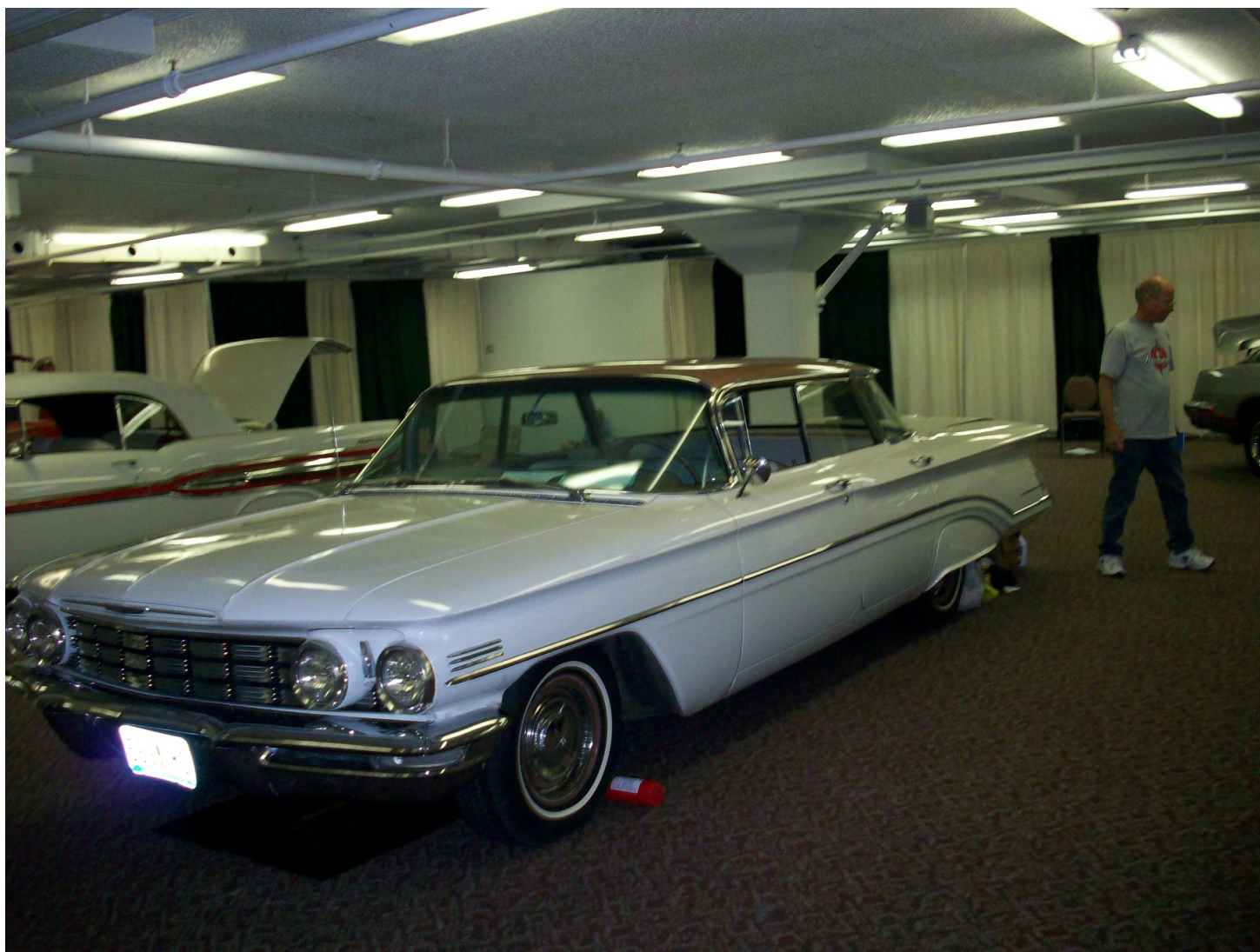
1960 Dynamic 88 @ 2008 Tan-Tar-A show