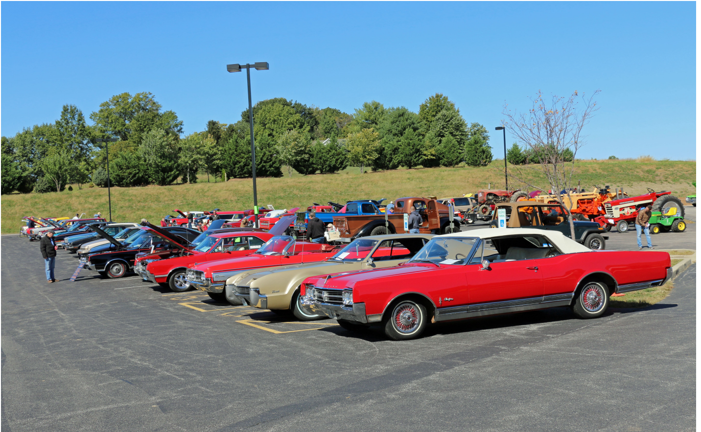
Olds Row at K of C show